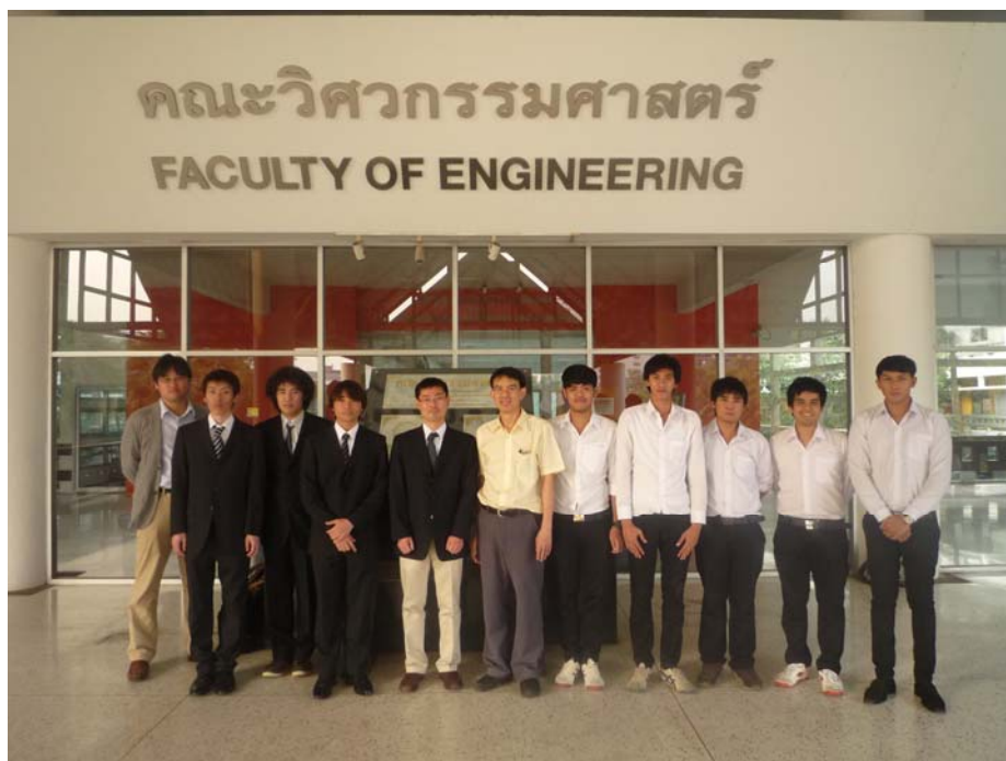
Photograph in front of FOE, Thammasat University