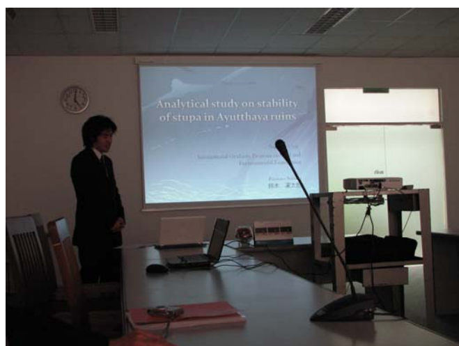
Examinations and discussion with FOE co-advisors