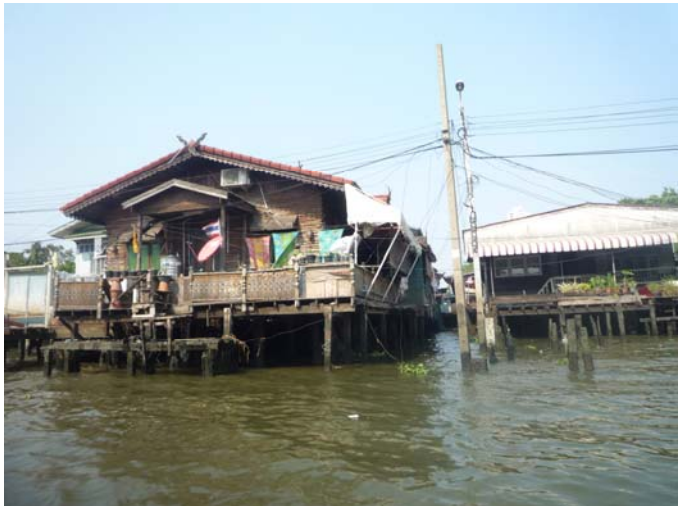
Site Visit to Chao Phraya River