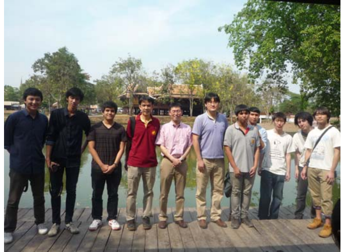
Research Visit to Ayutthaya Ruins with Thammasat university students