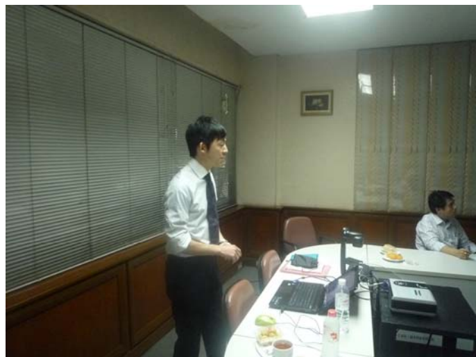
Examinations and discussion with SIIT and FOE co-advisors