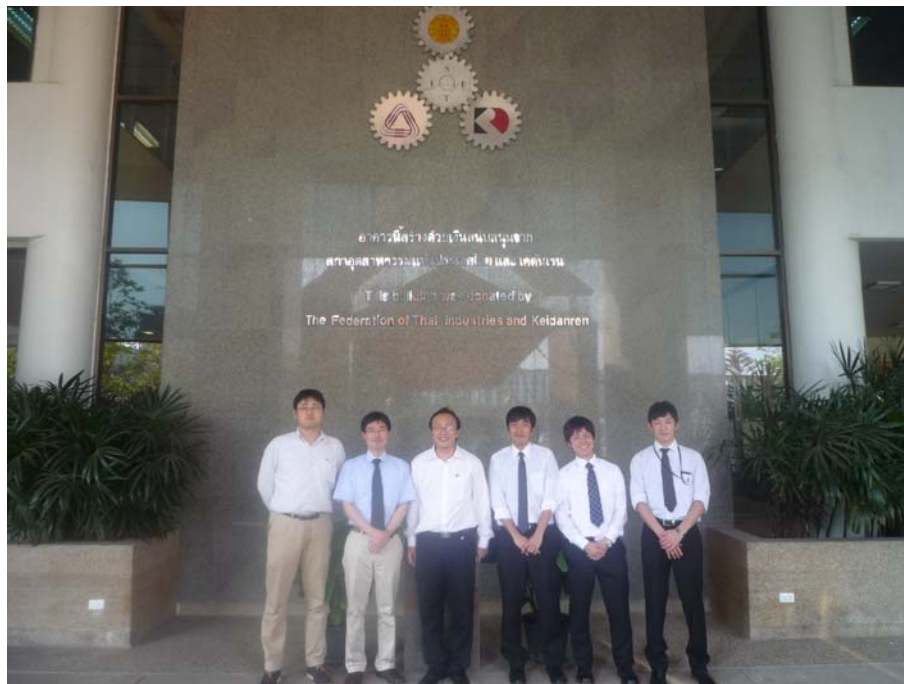
Photograph in front of SIIT, Thammasat University