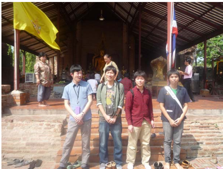
Research Visit to Ayutthaya Ruins with Thammasat university students