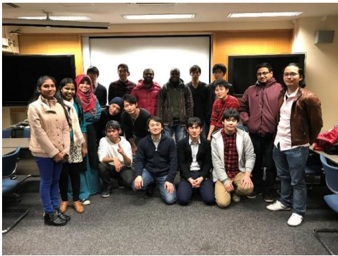
With Geoenvironment Group members