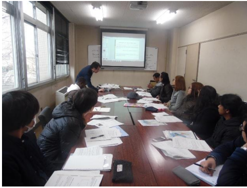
At a class