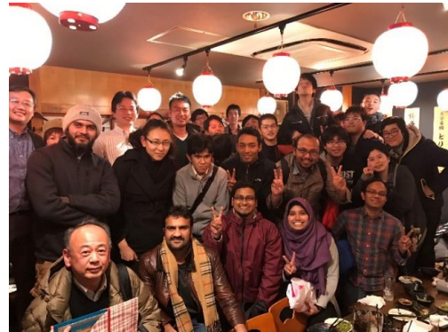
With Structural Engineering Group members