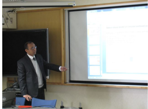
Research Presentation by a visiting student